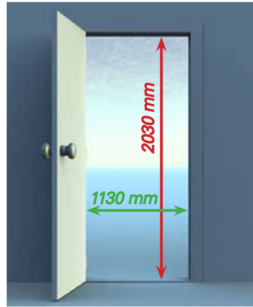
minimum sizes of the doors / passages