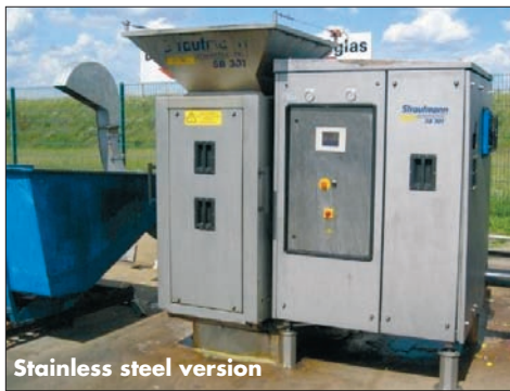
Stainless steel version